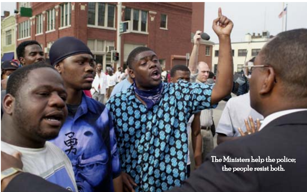
The Ministers help the police; the people resist both.

"Most everyone outside the Cincinnati area was treated to tightly edited footage of what appeared to be integrated crowds of blacks and whites. What actually happened was that a few local white Socialists and Communist activists joined in the rioting and later were reinforced by white leftist activists from outside the city and even the region. The national media then went to work editing the footage to make it look very much unlike what it really was - a RACE RIOT..."